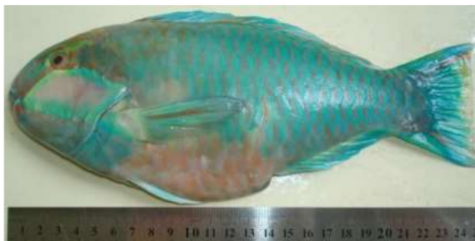
Figure 1. Bleeker's Parrotfish Chlorurus bleekeri captured in the Wallace Line, Makassar Strait, Indonesia

The male Bleeker's Parrotfish has a brighter color than the female. The female fish is dark brown with three to four pale stripes on the body and a yellowish tail. The male Bleeker's Parrotfish is greenish in color with pink scaly edges and a white rectangle on the cheeks and gill covers (operculum) bordered by a thick green line [5] (Figure 1).